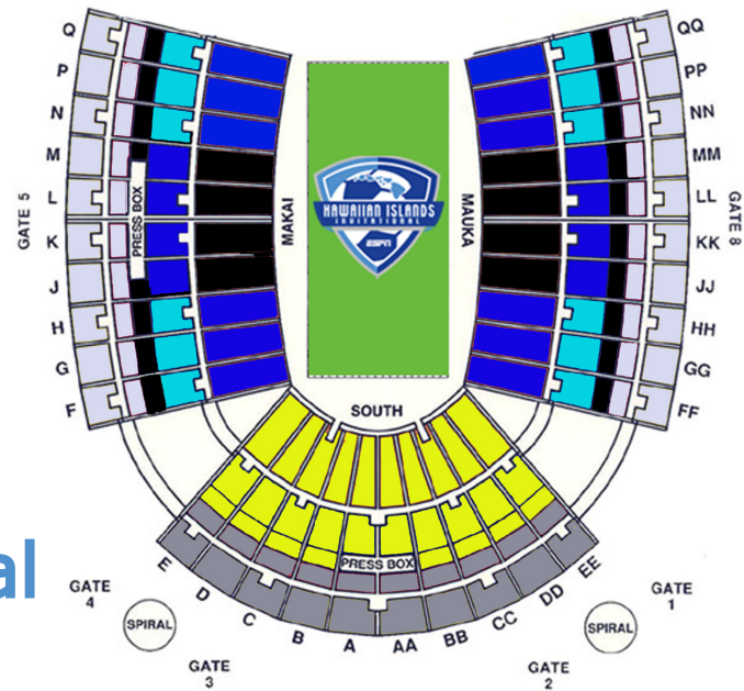
Hawaiian Islands Invitational Discount Ticket Pricing Seating Diagram

Hawaiian Islands Invitational February 23 & 25, 2012 Hawaiian Airlines Field at Aloha Stadium